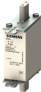
LV HRC fuse element, NH000, In: 6 A, gG, Un AC: 690 V, Un DC: 250 V, Front indicator, live grip lugs