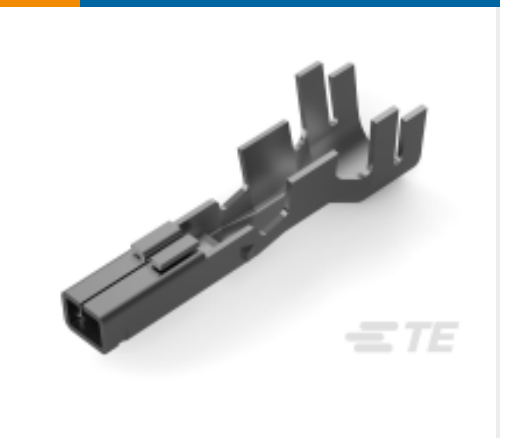
TE Part # 179593-1 AMP POWER D/LOCK RECCONT. L/P