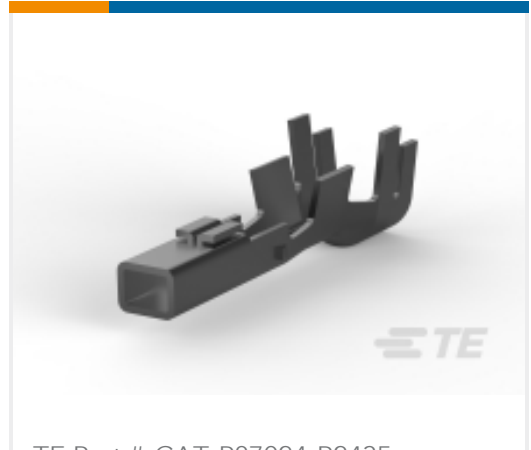
TE Part # CAT-P87024-R2435 Power Double Lock Receptacle