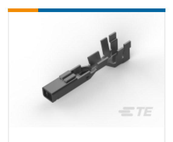
TE Part # 179592-1 AMP POWER D/LOCK REC CONT. L/P