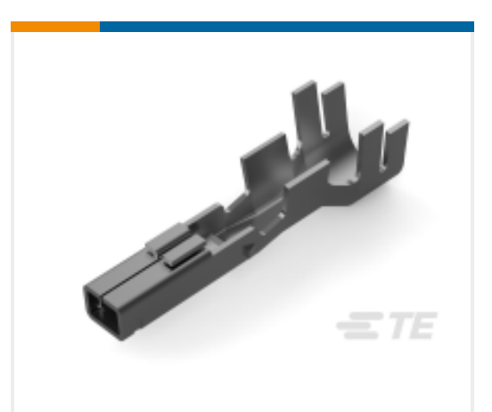
TE Part # 179593-2 POWER D/LOCK REC CONT. H/P L/P