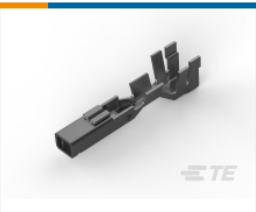
TE Part # 179592-2 POWER D/LOCK REC CONT. H/P L/P