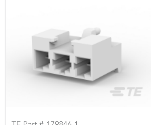
TE Part # 179846-1 AMP POWER D/LOCK T/HDR ASSY 3P