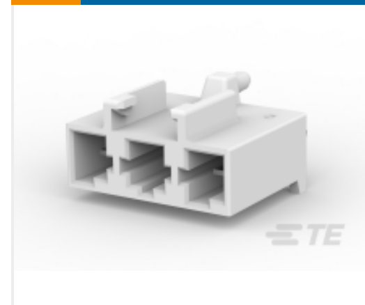
TE Part # 917745-1 AMP POWER D/L TAB HDR ASY 2P V