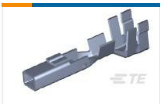
TE Part #177914-2 AMP POWER DBL LOCK REC (S)