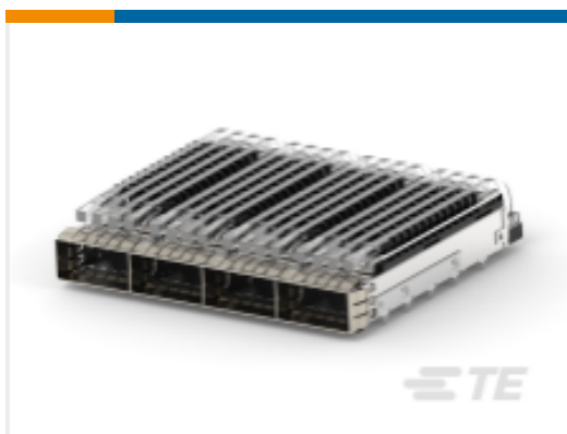
TE Part #2349642-3 CAGE ASSY, 1X4, QSFP28, SPRING, HS, LP