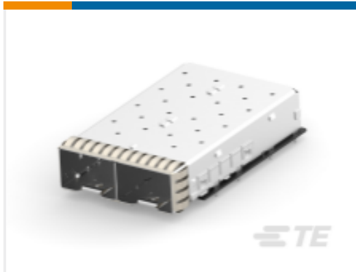
TE Part #2317010-1 ZSFP+ 1X2 CAGE BELLY TO BELLY