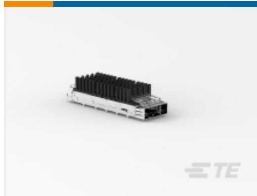
TE Part #4-2170705-6 CAGE ASSY, QSFP28 1X1, SPRING, HS, LP