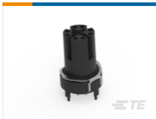
TE Part #394811-E M12 FEMALE, X CODE, 8P, 17MM SMT, CAT6A