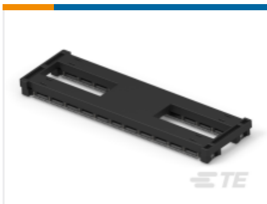
TE Part #2369315-1 16G 05FH 4H rec aassy 440POS 8u" Au