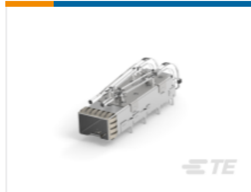
TE Part #2291672-2 SFP+ 1X1 CAGE ASSEMBLY, LIGHT PIPE