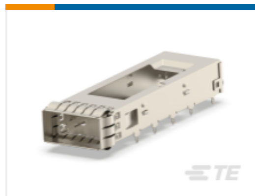
TE Part #2337376-1 CAGE ASSEMBLY, QSFP28 1X1, PCI, OP