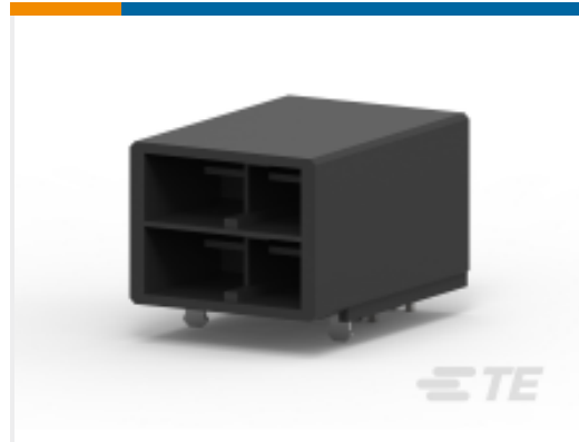
TE Part #1-1123309-4 DYNAMIC D-5 HDR H ASSY 4P XX Ag