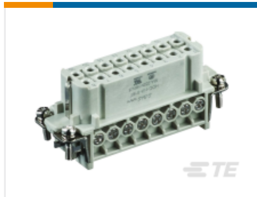
TE Part #T2010162201-000 HA-016-F