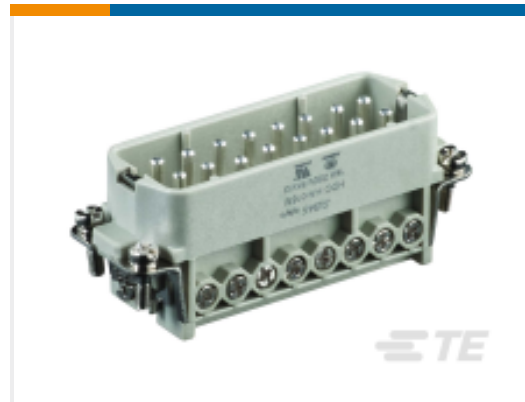
TE Part #T2010162101-000 HA-016-M