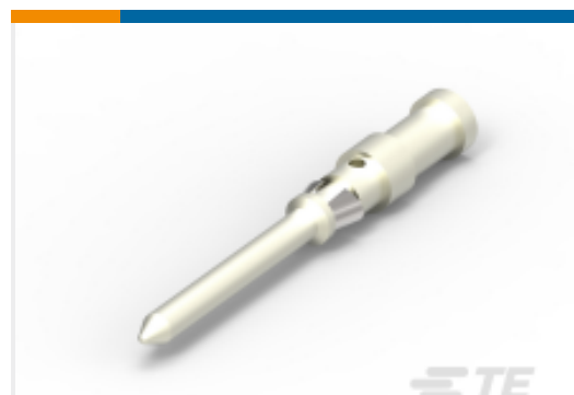
TE Part #T2020001015-000 CDM-1.5