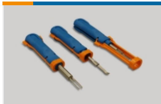
Insertion & Extraction Tools(5)