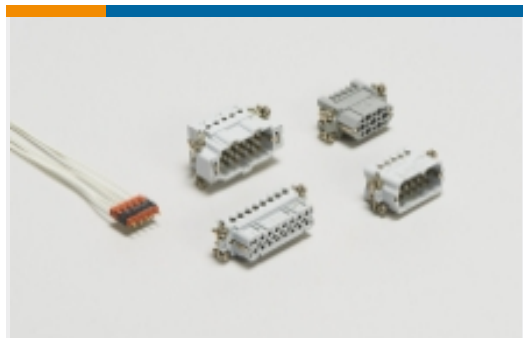
Rectangular Contact Inserts(43)