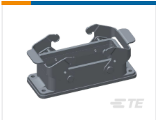
TE Part #T1410162000-000 H16B-AG