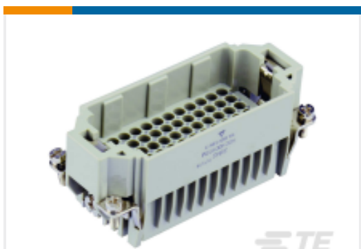
TE Part #T2030722101-000 HDD-072-M