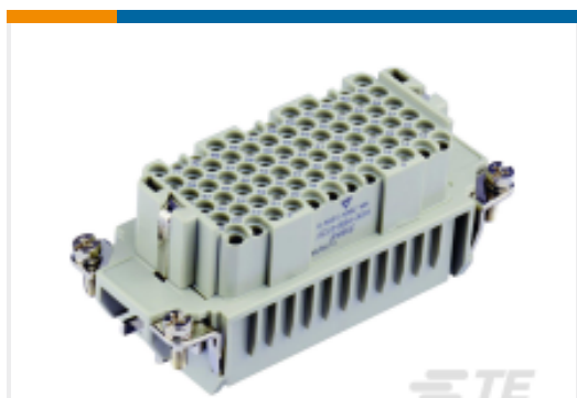
TE Part #T2030722201-000 HDD-072-F