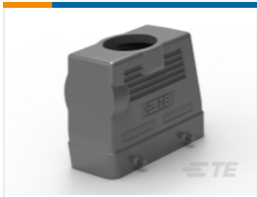
TE Part #T1240160129-000 H16B-TGH-PG29