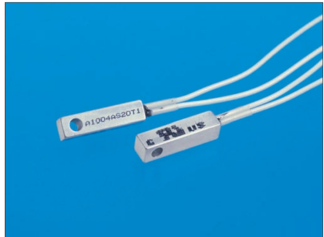
UL Listed Surface Temperature Sensor

SS&C assembly A1004AS20T1 is a general purpose thermistor probe for temperature sensing and is listed with Underwriters Laboratories (Certification file E193945). This sensor can be used to monitor air temperature or can be screw mounted for surface temperature measurement. The assembly consists of a highly stable NTC thermistor that is epoxied into an aluminum housing. The thermistor is a 10k\Omega thermistor with an accuracy of \pm 0.2^\circ\text{C} from 0^\circ\text{C} to 70^\circ\text{C} . The sensor leads are AWG#20, teflon insulated UL rated wire. Sleeving is used to provide strain relief and to guarantee the UL rated 400 volt isolation between the sensor and the housing. The assembly is UL rated for operation to 105^\circ\text{C} .