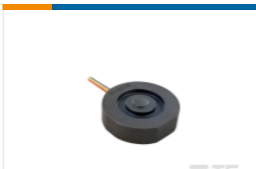
TE Part #20009605-16 FX29K0-040B-0010-L