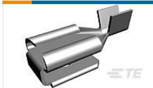
TE Part #62276-1 250 FASTON REC 18-14 AWG TPBR