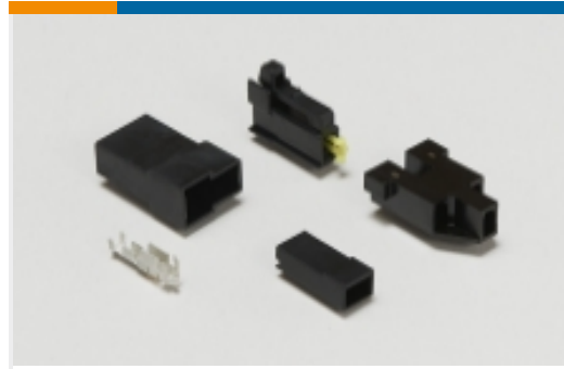
Magnet Wire Terminals(192)