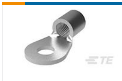
TE Part #2-321598-3 TERMINAL,SOLIS R 6 1/4 TAPE