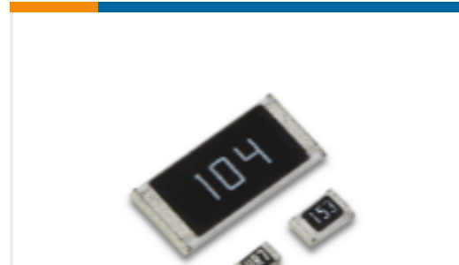
TE Part #1-2176349-9 CRGCO 2512 330R 1%