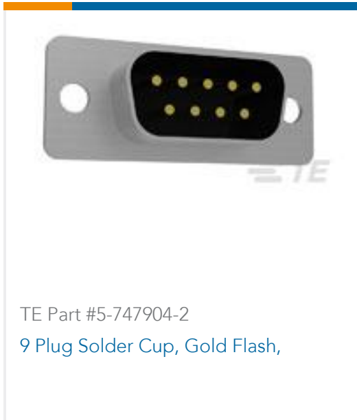
TE Part #5-747904-2 9 Plug Solder Cup, Gold Flash,