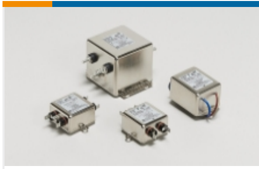
Single Phase Filters(11)