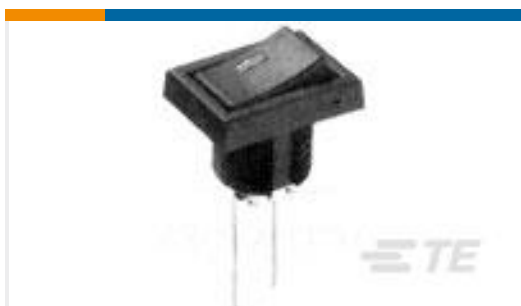
TE Part #5-1437595-2 TRD11F10WL=SUB MINI ROCKER BLA