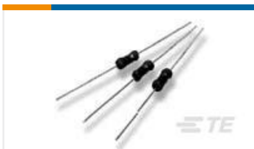
TE Part #7-1625890-0 2W SM M/OX 5% 82K