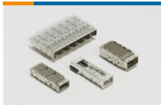
Pluggable IO Connectors & Cages(424)