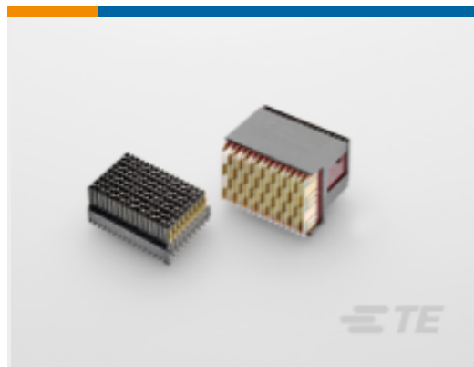
TE Part #2302794-1 RAPLUGASSY,CENTERRP0,RTM,VPX, MGRT3