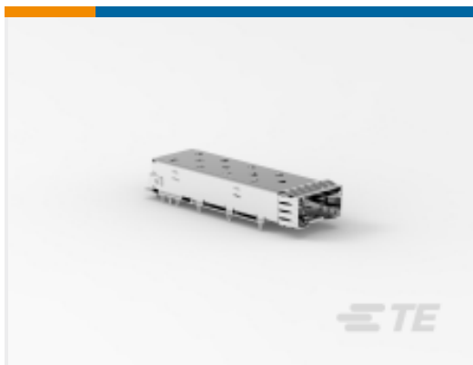
TE Part #2274001-1 ZSFP+ 1X1 CAGE ASSEMBLY PRESSFIT