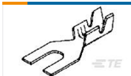
TE Part #60773-2 SPADE TERMINAL 18-14 AWG TPBR