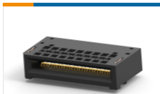
TE Part #2327672-1 RECEPT ASSY, RA, 56 POS, SLIVER 2.0