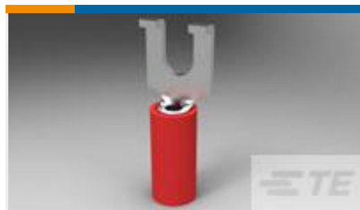
TE Part #2-322777-1 PIDG SPDFLG 22-16COMM22-18MIL6