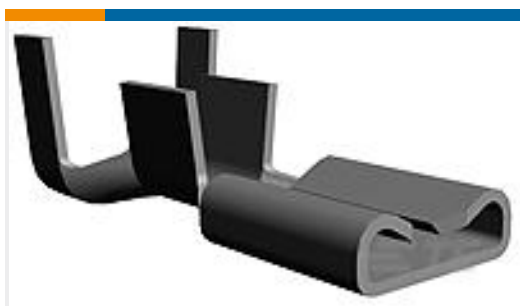
TE Part #42801-2 187 FASTON REC 20-16 AWG TPBR