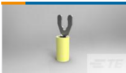
TE Part #52943-1 TERMINAL,PIDG SPR SPD 12-10 10