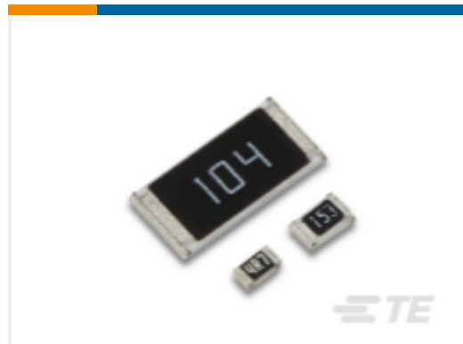
TE Part #1-2176343-7 CRGCO 1206 220R 1%