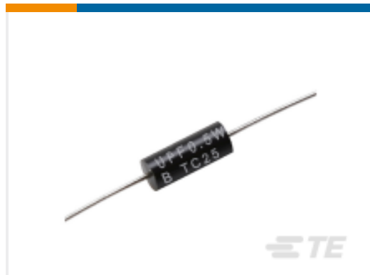
TE Part #2176163-9 UPF50 0.1% 5PPM 20R