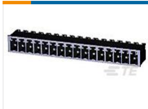
TE Part #1-284517-0 10P TERMIBLOK HDR DIR POL