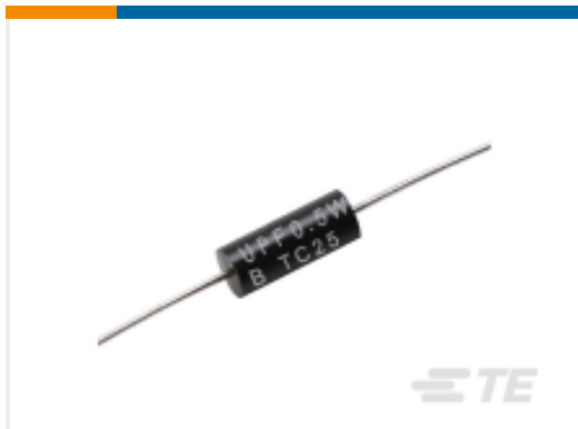
TE Part #2176163-2 UPF50 0.1% 5PPM 100R