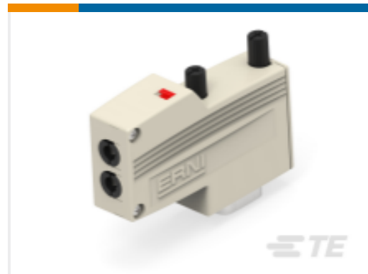
TE Part #144176-E ERBIC BUS B BUS-SYSTEM SYS PROF HO SC CU