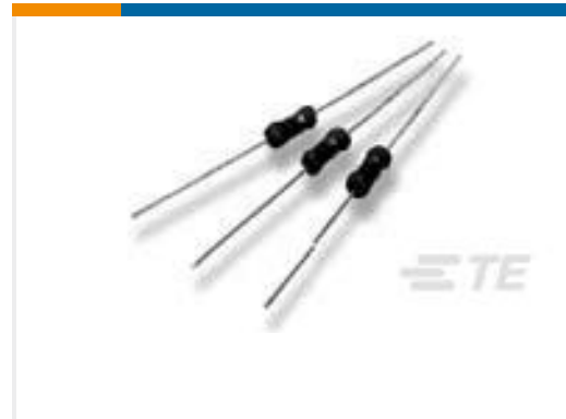
TE Part #2-1625890-6 2W SM M/OX 5% 1M0