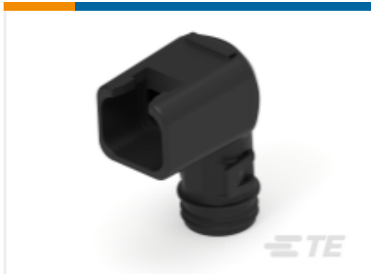
TE Part #1011-264-0405 BKSHL, 4P, BLK, PLG,RA,NW6/7.5/8.5 /10