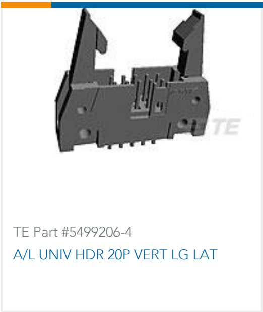
TE Part #5499206-4 A/L UNIV HDR 20P VERT LG LAT