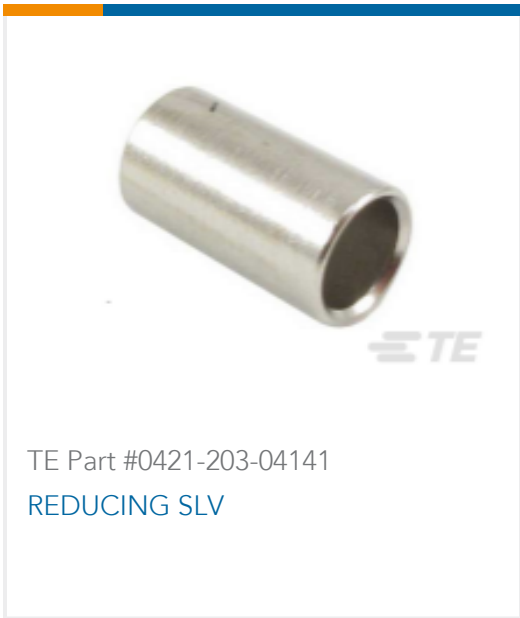
TE Part #0421-203-04141 REDUCING SLV