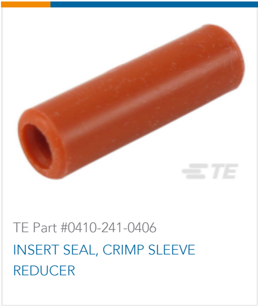
TE Part #0410-241-0406 INSERT SEAL, CRIMP SLEEVE REDUCER