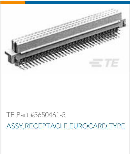
TE Part #5650461-5 ASSY, RECEPTACLE, EUROCARD, TYPE