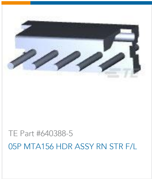
TE Part #640388-5 05P MTA156 HDR ASSY RN STR F/L