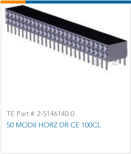
TE Part # 2-5146140-0 50 MODII HORZ DR CE 100CL