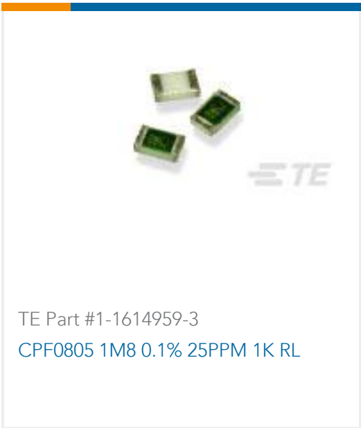
TE Part #1-1614959-3 CPF0805 1M8 0.1% 25PPM 1K RL