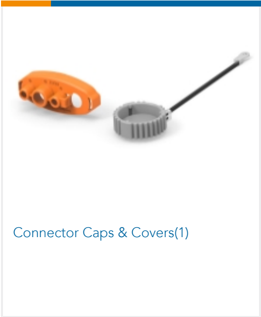
Connector Caps & Covers(1)