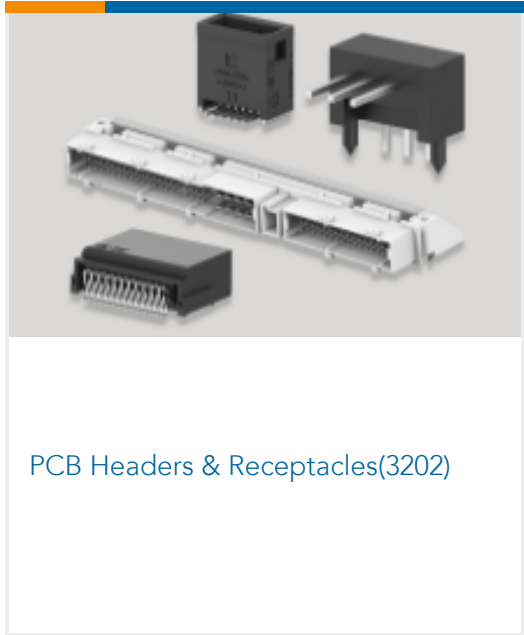
PCB Headers & Receptacles(3202)