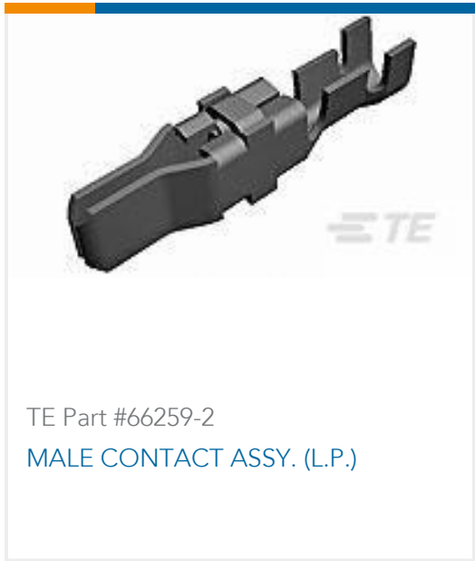
TE Part #66259-2 MALE CONTACT ASSY. (L.P.)