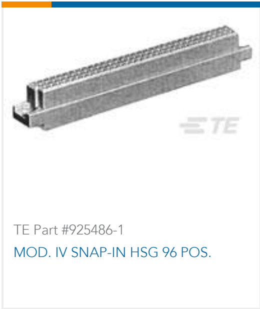
TE Part #925486-1 MOD. IV SNAP-IN HSG 96 POS.