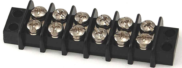
(6 Pole shown)

Insulator Strip Required for Voltage Rating