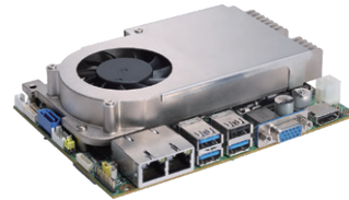
▲ Assembly View