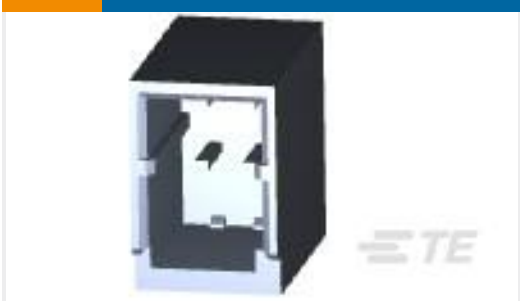
TE Part #1-1827875-2 DYNAMIC 1200D HDR ASSY V 4P X BLACK GOLD