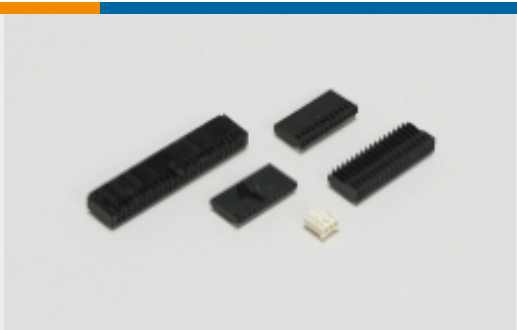
Wire-to-Board Connector Assemblies & Housings(159)