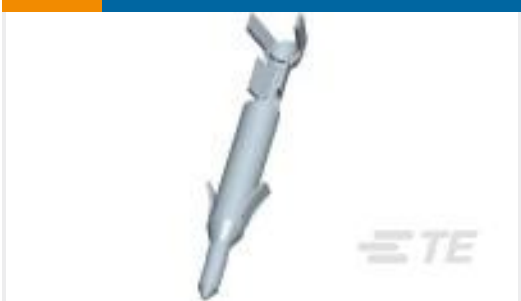
TE Part #170359-1 UNIV M-N-L PIN 26-22 AWG