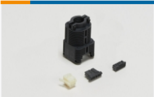
Rectangular Connector Housings(2)