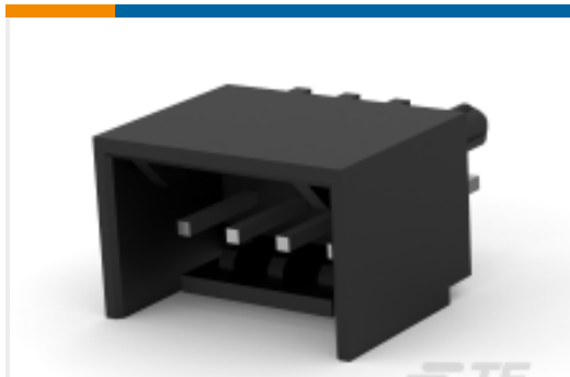
TE Part #2-644486-4 Polyester Vertical PCB Header: 2.54 mm, Shrouded, MTA 100