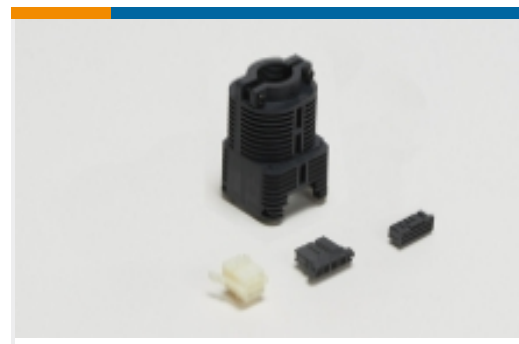
Rectangular Connector Housings(49)