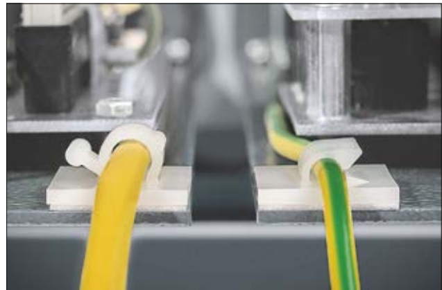
Self adhesive one piece fixing mounts RA6 (l) and RB5 (r).