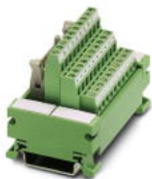
VARIOFACE COMPACT LINE, sensor module for the connection of 8 p-n-p sensors, for assembly on DIN rail NS 35/7.5, screw connection

Please be informed that the data shown in this PDF Document is generated from our Online Catalog. Please find the complete data in the user's documentation. Our General Terms of Use for Downloads are valid ( http://phoenixcontact.com/download )