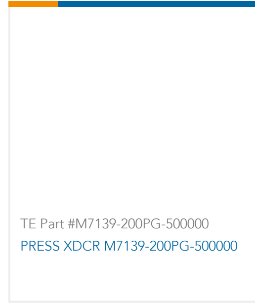
TE Part #M7139-200PG-500000 PRESS XDCR M7139-200PG-500000