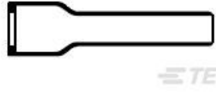
TE Part #814530-000 202D232-4-0