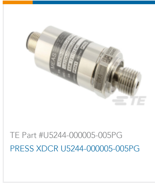
TE Part #U5244-000005-005PG PRESS XDCR U5244-000005-005PG