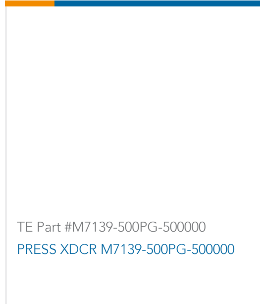
TE Part #M7139-500PG-500000 PRESS XDCR M7139-500PG-500000