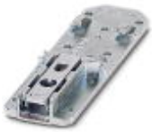
Universal DIN rail adapter

Assembly adapters - UTA 107/30 - 2320089