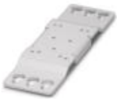
Universal wall adapter for securely mounting the power supply in the event of strong vibrations. The power supply is screwed directly onto the mounting surface. The universal wall adapter is attached at the top/bottom.

Assembly adapters - UWA 182/52 - 2938235