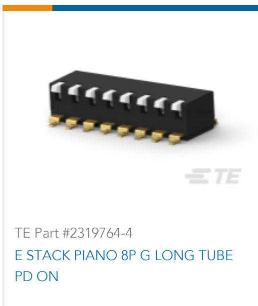
TE Part #2319764-4 E STACK PIANO 8P G LONG TUBE PD ON