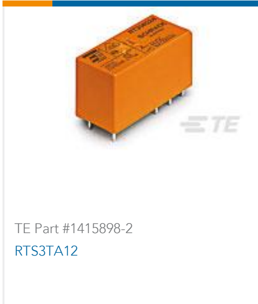
TE Part #1415898-2 RTS3TA12