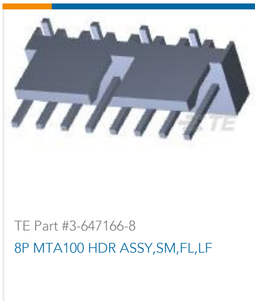
TE Part #3-647166-8 8P MTA100 HDR ASSY,SM,FL,LF