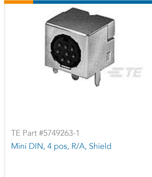
TE Part #5749263-1 Mini DIN, 4 pos, R/A, Shield