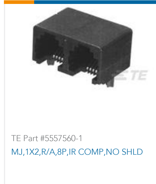
TE Part #5557560-1 MJ,1X2,R/A,8P,IR COMP,NO SHLD