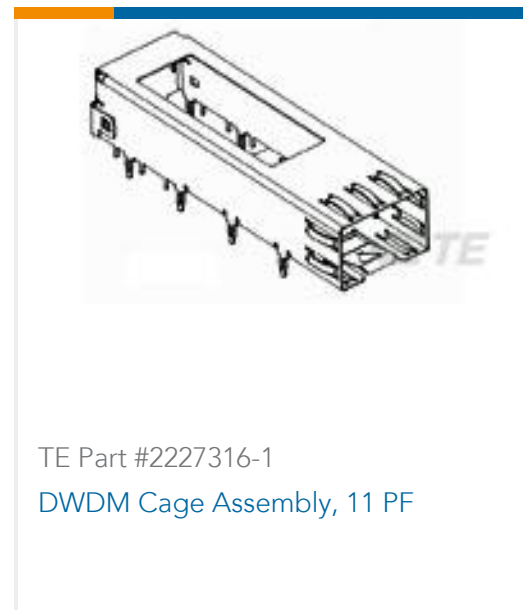
TE Part #2227316-1 DWDM Cage Assembly, 11 PF