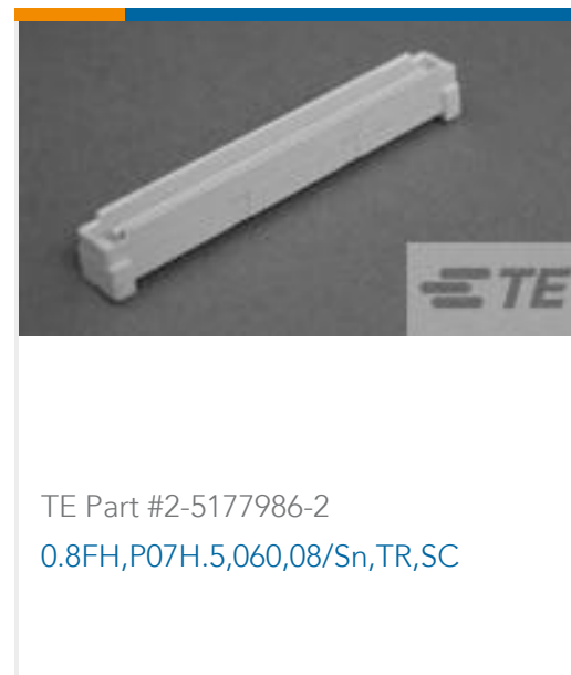
TE Part #2-5177986-2 0.8FH,P07H.5,060,08/Sn,TR,SC