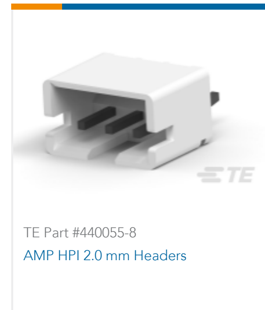
TE Part #440055-8 AMP HPI 2.0 mm Headers