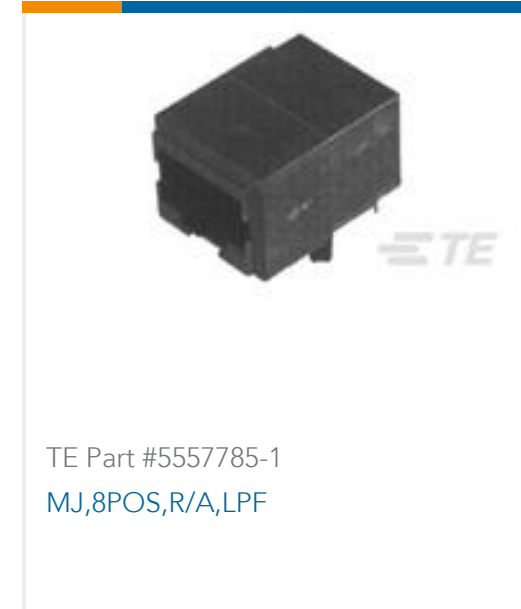
TE Part #5557785-1 MJ,8POS,R/A,LPF