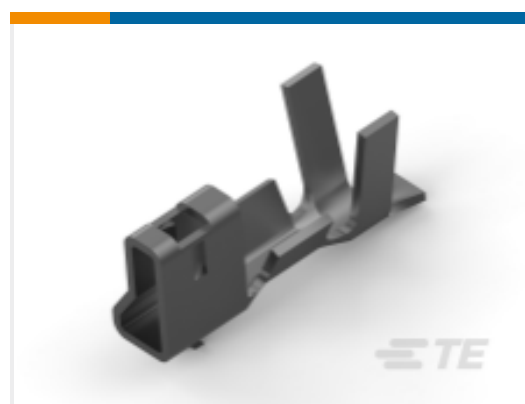
TE Part # CAT-AM7017-C7671 Common Termination Contacts — POWER TRIPLE LOCK