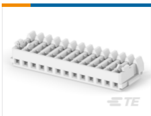
TE Part # 1-353293-3 MINI CT MT REC ASSY 13P GRAY