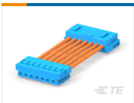
TE Part # 2405869-7 CT 7P 300MM CABLE ASSEMBLY 2-179228-7