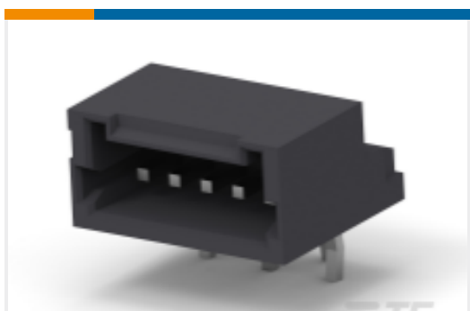
TE Part #2-292206-5 MINI CT SGL DIP H 5P BLACK