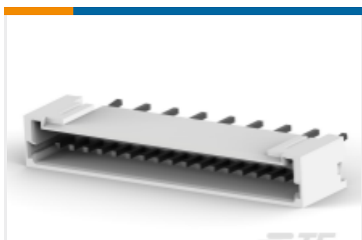
TE Part #3-292207-8 MINI CT SGL DIP V 18P BLACK