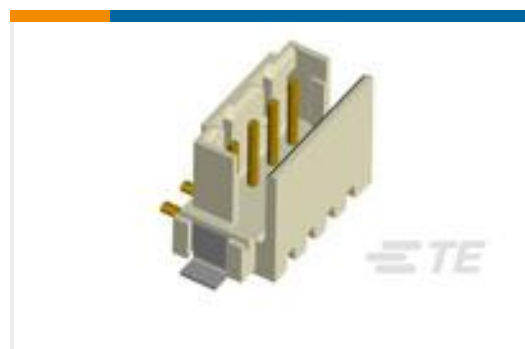
TE Part #292174-4 CT BOX HDR V SMT 4P O/TAPE NAT