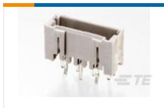
TE Part #292207-3 MINI CT SGL DIP V 3P NAT