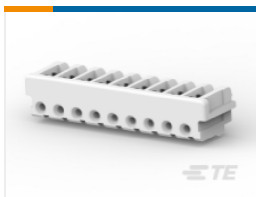
TE Part # CAT-AM7017-H8172 AMP COMMON TERMINATION HOUSINGS