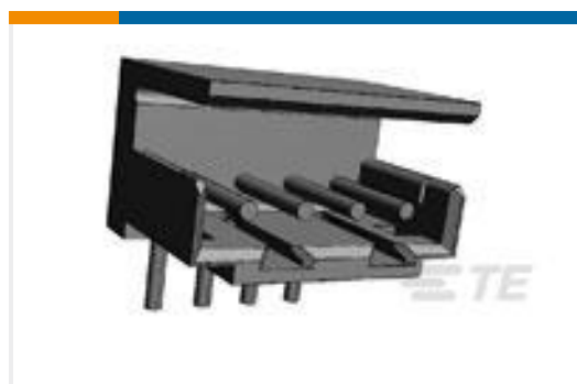
TE Part #292250-6 CT P/HDR BOX H ASSY 6P W/KINK