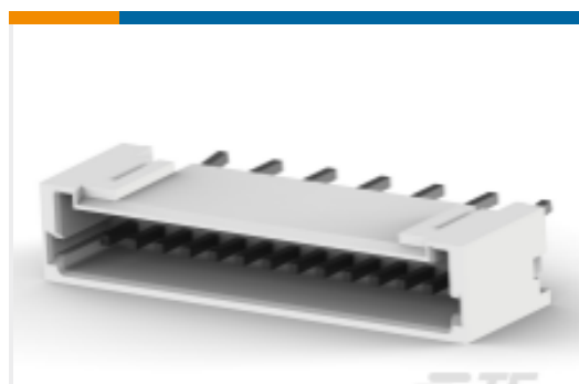
TE Part #3-292207-4 MINI CT SGL DIP V 14P BLACK