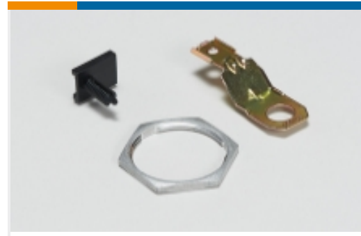
Other Automotive Connector Accessories(27)