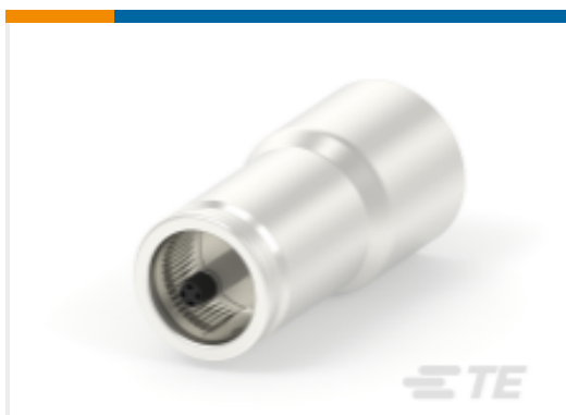
TE Part #2386340-3 DIA 14MM,TERMINAL,FAM SLD /UNSLD,CB