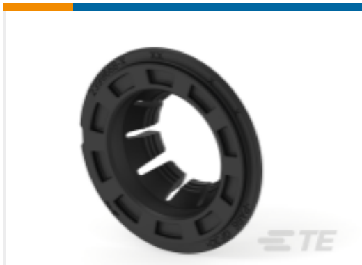
TE Part #2399669-2 Power Tube HVP-HD 1400 Accessories