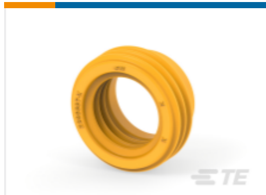
TE Part #2399667-3 H&S 120mm, SWS