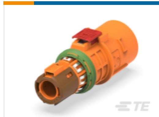
TE Part #2399663-2 Housing for Female Terminals HVP-HD 1400