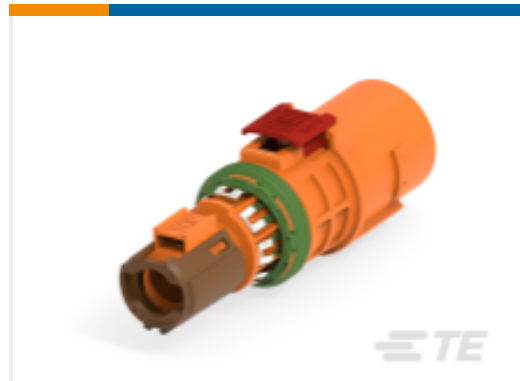
TE Part #1-2394085-2 Pre-ASSY,Finger Access,Code L