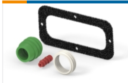
Connector Seals & Cavity Plugs(5)