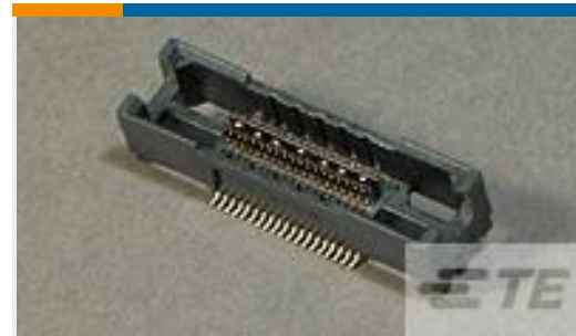
TE Part #5767171-1 MICTOR RECEPT ASSY, 38 POS. TA