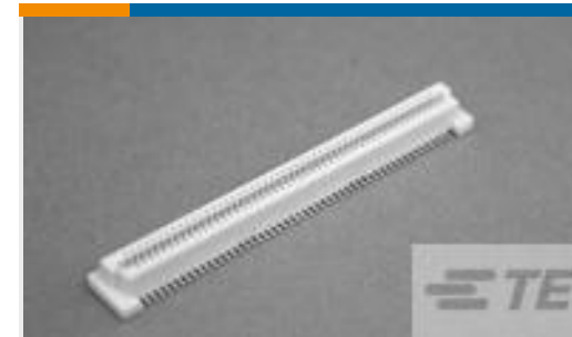
TE Part #5177985-8 0.8FH,R05H.5,160,08/Sn,TR,SC