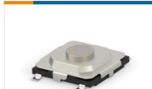
TE Part #2337237-3 TACT MINI GW 5.2X5.2X1.5 160GF