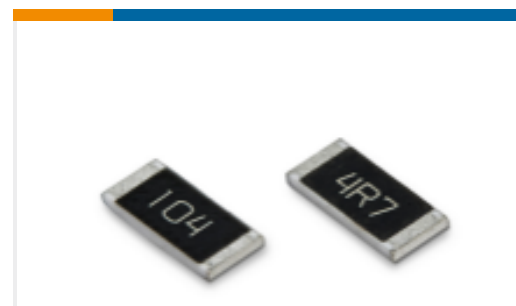
TE Part #4-2176455-9 CPF 0402 348K 0.1% 25ppm 1K RL