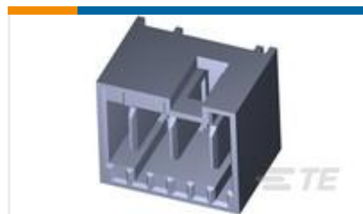
TE Part #5-1971846-3 3P, RAST 5 Tab Header, THV