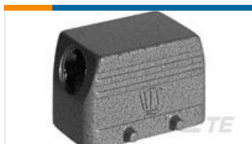
TE Part #1-1102261-6 HB.10.STS.1.16.G