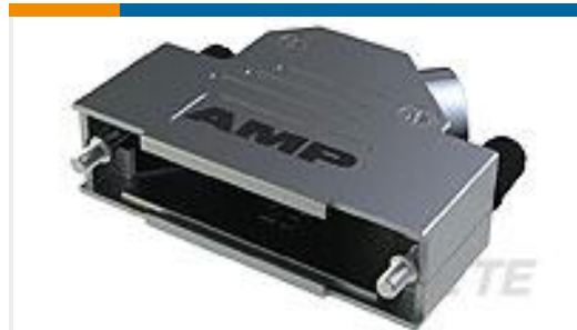
TE Part #3-1478763-7 METAL BACKSHELL 37 WAY 45 DE