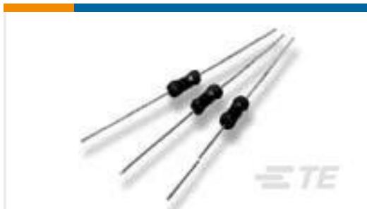
TE Part #3-1625890-8 2W SM M/OX 5% 2K2