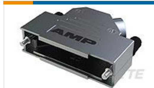
TE Part #5-1478763-2 Metal backshell 15 way 45 Deg Entry-KIT