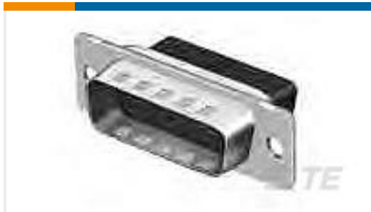
TE Part #167294-1 25P HDP20 PLUG ASSY