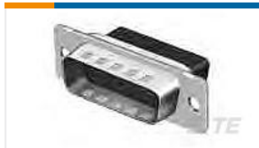
TE Part #205210-3 PLUG ASSY SIZE 4