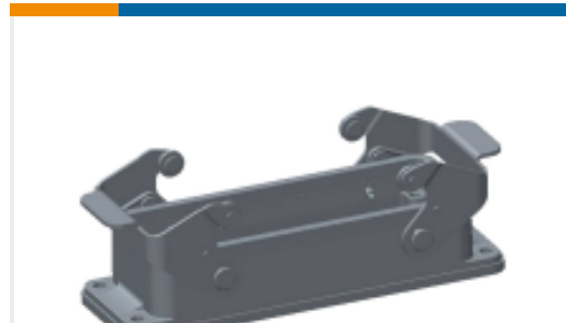
TE Part #T1410241000-000 H24B-AGS