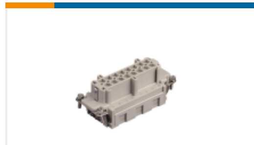
TE Part #T2040163201-000 HE-016-FS