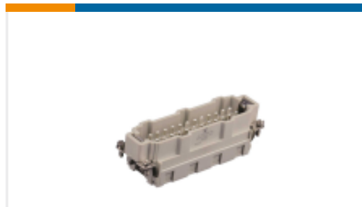
TE Part #T2040243101-000 HE-024-MS