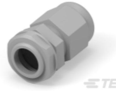
TE Part #1478768-3 ANTI-VIB NYLON GLD 20MM GREY ORA