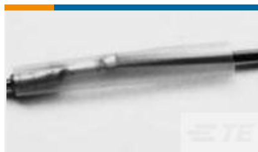
TE Part #CV20914001 RW-175-E-3/64-X-SP