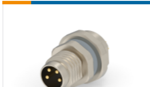
TE Part #T4030014041-000 M8.MLE.PNLREAR.4POS.STR.