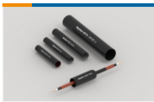
Power Cable Tubing & Accessories(8)