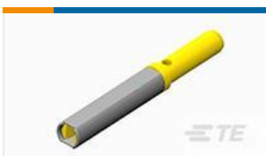
TE Part #450213-000 CTA-0165