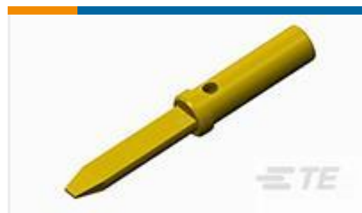
TE Part #226335-000 CTA-0166