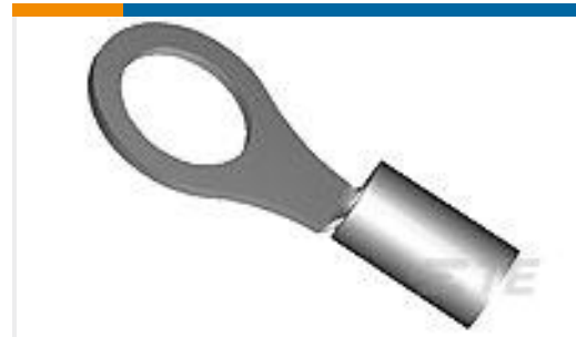
TE Part #322329 TERMINAL,SOLIS R HT 16-14 6