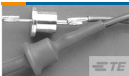
TE Part #5677564008 RNF-3000-3/1-0-SP