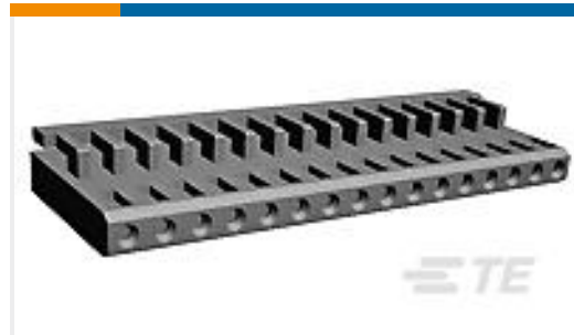
TE Part #926475-4 MOD 4 HSG