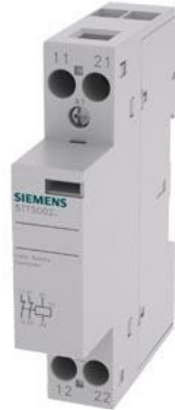
INSTA contactor with 2 NC contacts Contact for 230 V AC, 400V 20A Control 24 V AC