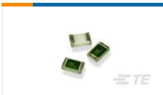
TE Part #9-1879208-9 CPF0402 150K 0.1% 25PPM 5K RL