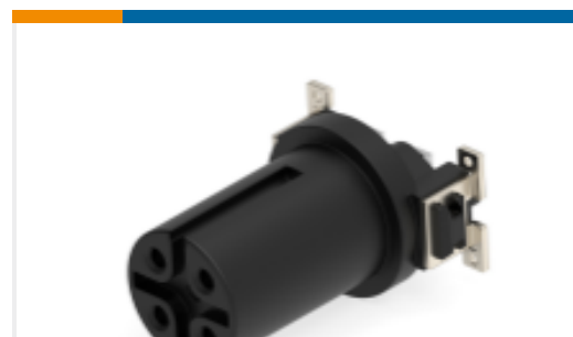
TE Part #224064-E M12 FEMALE, A CODE, 5P, 17MM SMT