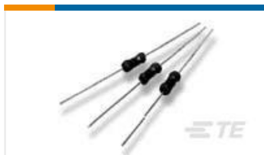
TE Part #3-1879353-2 RR02 5% 82K AMMO