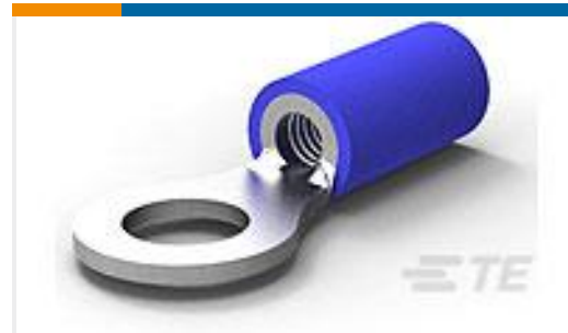
TE Part #32960 TERMINAL,PG R 16-14 10