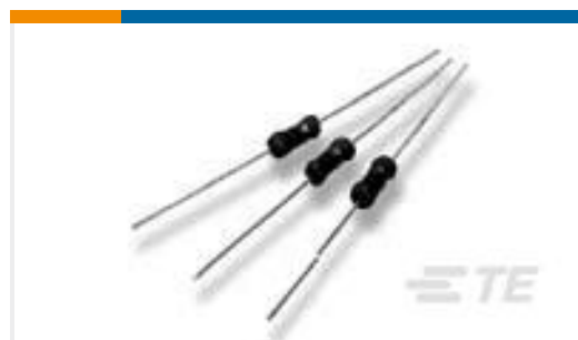
TE Part #3-1879354-9 RR03 5% 12R AMMO