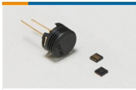
Humidity Sensor Components(18)