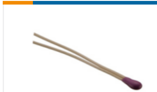
TE Part #GA100K6A11A DISCRETE 100K OHMS,+/-0.1C 0C TO 70C