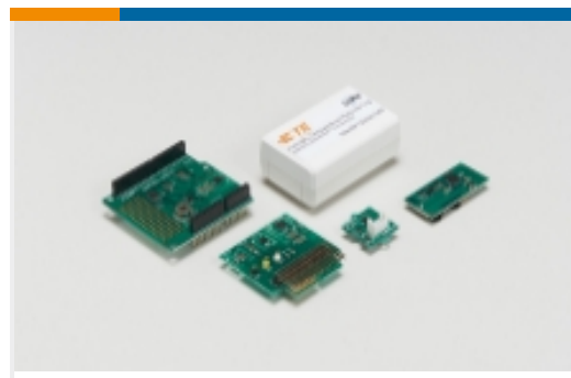
Sensor Development Boards and Evaluation Kits(3)