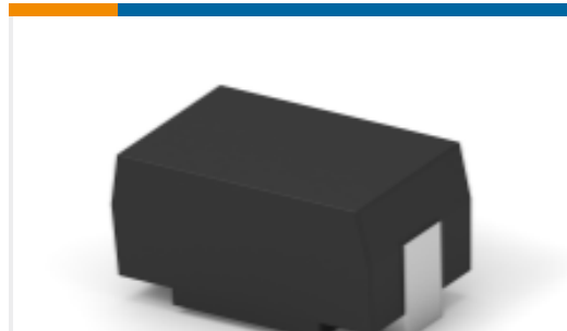
TE Part #5-1879234-1 SMD Power Resistor: 7 Watt, 200-2M Ohm