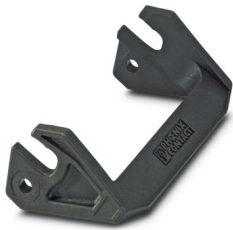
Single locking latch for B16 housing, HC-EVO....AL and HC-STA....AL

Please be informed that the data shown in this PDF document is generated from our online catalog. Please find the complete data in the user documentation. Our general terms of use for downloads are valid.