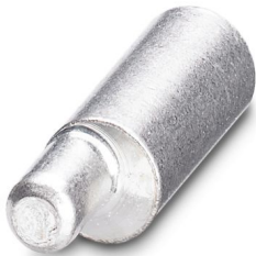
Cable lug for HEAVYCON-MODULAR; PE connection extension to 16 mm 2 , for crimping with crimp pliers

Please be informed that the data shown in this PDF document is generated from our online catalog. Please find the complete data in the user documentation. Our general terms of use for downloads are valid.