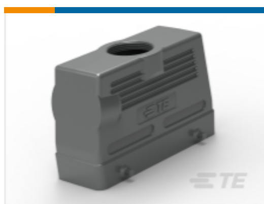
TE Part # T1240240121-000 H24B-TGH-PG21