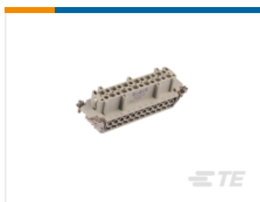
TE Part # T2040242201-000 HE-024-F