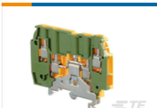
TE Part #1SNA195638R2300 M4/6.4A.P