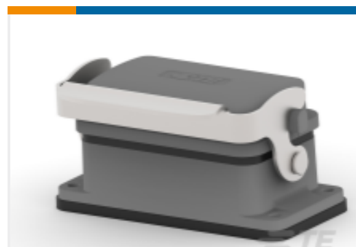
TE Part #T2120100220-000 ZGGP-H10BSK 1-7/2-8/3-9/4-6/5-10