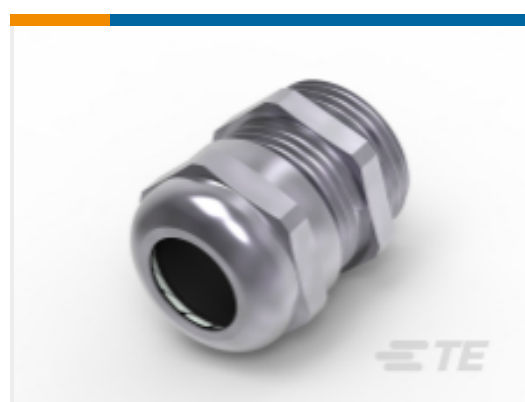
TE Part # T3609210101-000 DLX-21-MS