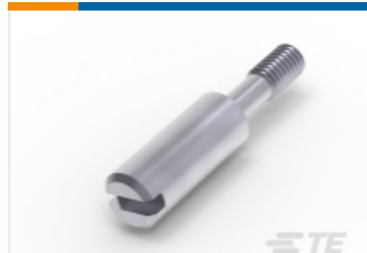
TE Part #T0931003003-000 CODING-PIN-M3