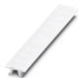
Zack marker strip, Strip, white, unlabeled, can be labeled with: Plotter, Mounting type: Snap into tall marker groove, for terminal block width: 6.2 mm, Lettering field: 6.15 x 10.5 mm

Zack marker strip - ZB 6:UNBEDRUCKT - 1051003