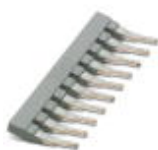
Insertion bridge, Number of positions: 10, Color: gray