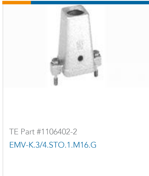
TE Part #1106402-2 EMV-K.3/4.STO.1.M16.G