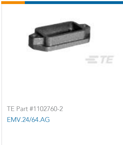
TE Part #1102760-2 EMV.24/64.AG