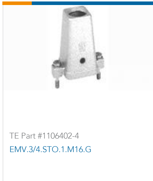
TE Part #1106402-4 EMV.3/4.STO.1.M16.G