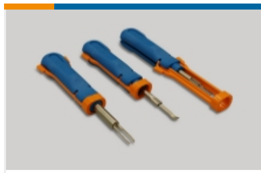
Insertion & Extraction Tools(4)