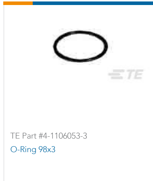
TE Part #4-1106053-3 O-Ring 98x3