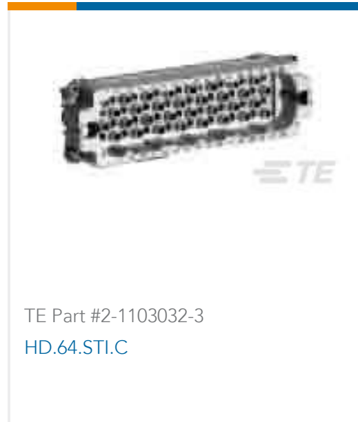
TE Part #2-1103032-3 HD.64.STI.C