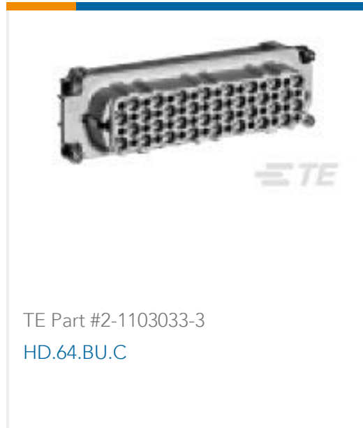
TE Part #2-1103033-3 HD.64.BU.C