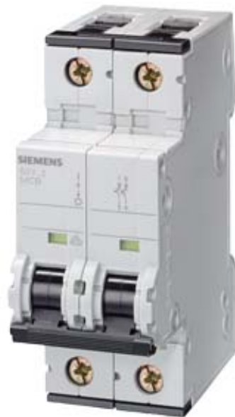
CIRCUIT BREAKER 230V 10KA, 1+N-POLE, D, 2A, D=70MM