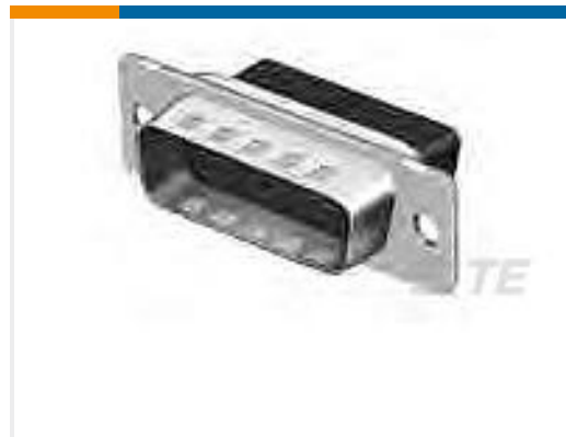
TE Part #167293-1 15P.HDP20 PLUG ASSY