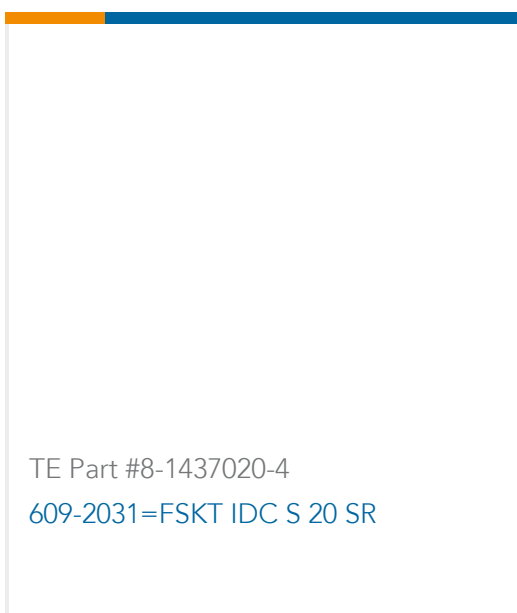
TE Part #8-1437020-4 609-2031=FSKT IDC S 20 SR