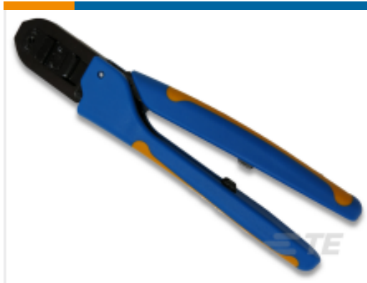
TE Part # 91503-1 CCII AMPLIMITE 20 DF PIN SKT 28-20 ASSY