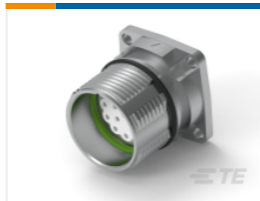
TE Part #AEA227N00000201000 623 RECEPTACLE, SPEEDTEC-READY