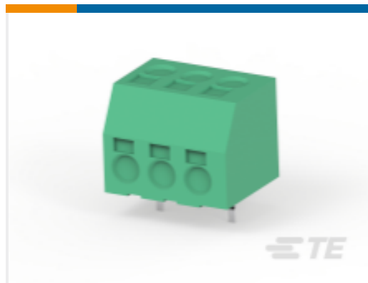
TE Part #1-2834014-3 3POS 5.0MM DES CONN.