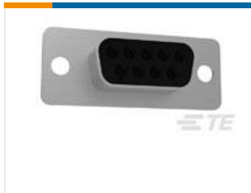
TE Part #164533-4 25P.HDP20 REC.ASSY.