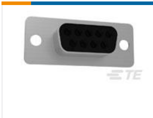
TE Part #164532-4 15P.HDP20 REC.ASSY.