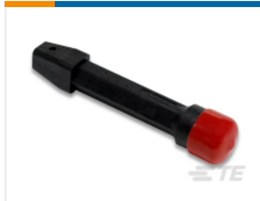
TE Part # 91285-1 INSERT/EXTRACT TOOL ASSEMBLY