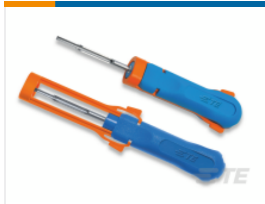
TE Part # 1579007-9 EXTRACTION TOOL