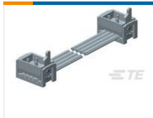
TE Part #2205063-1 CA MICRO-MATCH MOW-MOW 10POS