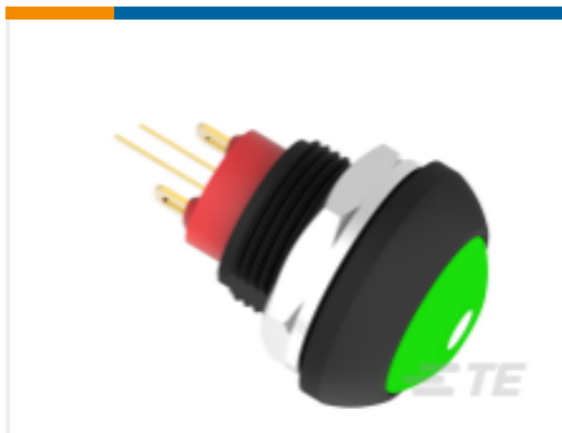
TE Part #1-2329387-6 PB OFF/ON FC GRE M1 TERM WHI LED IP68