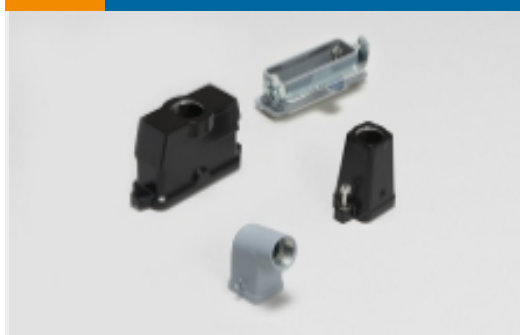
Rectangular Connector Hoods & Bases (1257)