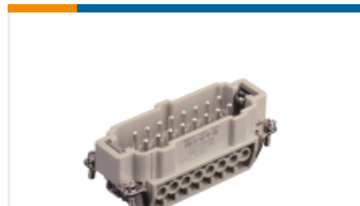
TE Part #T2040162101-000 HE-016-M