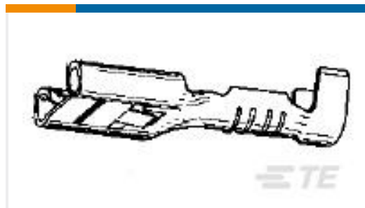
TE Part #280756-2 FF 375 REC 3-6MM2 TPBR