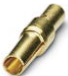
Crimp contact, turned, contact diameter: 2 mm, crimp range: 1 mm 2 ... 1.5 mm 2