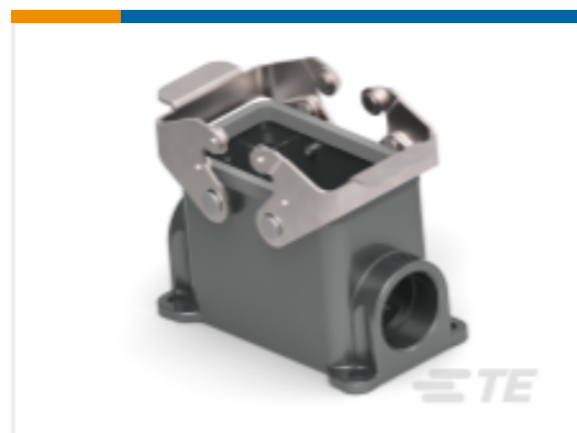
TE Part #T1440101120-000 H10B-SGRS-M20