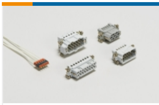
Rectangular Contact Inserts(14)