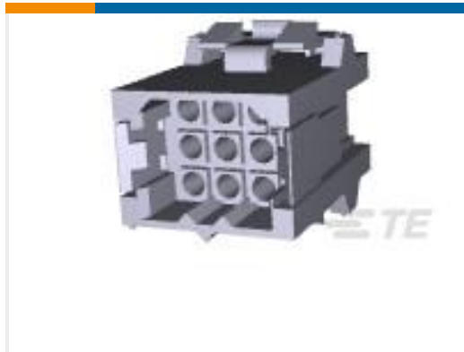
TE Part #207440-1 9 POS SQ GRID METRIMATE-RCPT