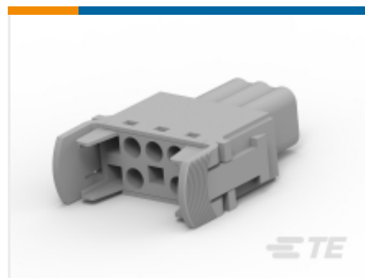
TE Part #T2110052201-000 HMN-005-FS