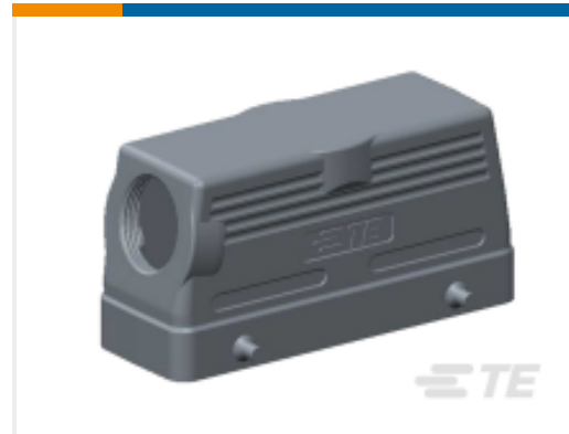
TE Part #T1210240125-000 H24B-TS-M25