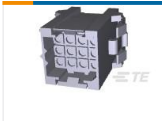
TE Part #207018-1 METRIMATE RCPT 12 POS