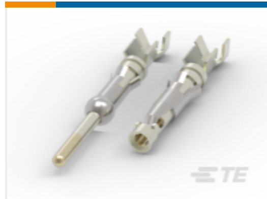
TE Part #1-66359-0 Strip Pin and Socket Contacts, Type III