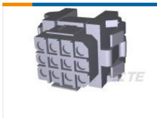
TE Part #207017-1 METRIMATE PLUG, 12 POS