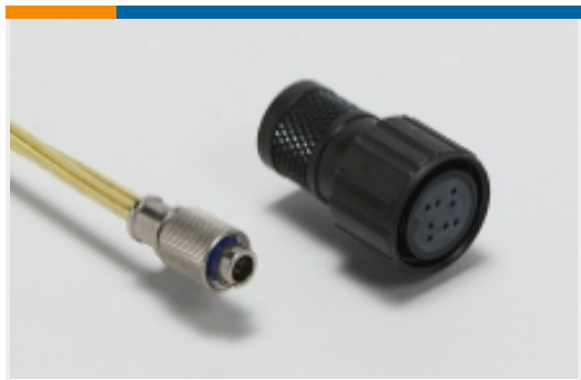
Standard Circular Connectors(1)