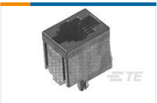
TE Part #5558872-1 MJ,TE,4P,W/O PNL STOPS