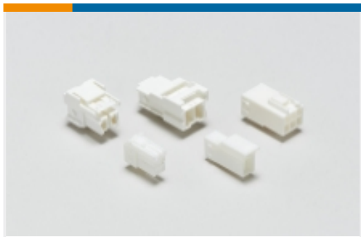
Rectangular Power Connectors(670)