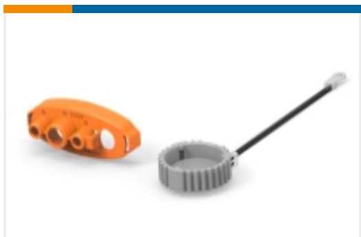
Connector Caps & Covers(34)