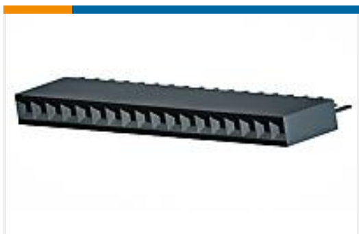
TE Part #6-534237-6 18 MODII VRT SR CE 100/115