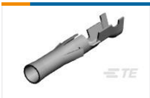
TE Part #350417-1 .093 COMM P&S SOK 18-24 PTPBR