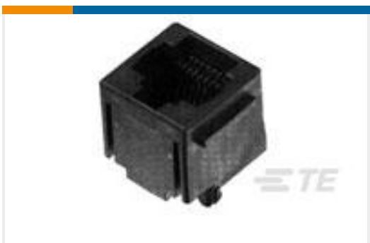
TE Part #5569284-1 MJ,TE,8P