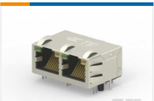
TE Part #2301996-7 RJ45 JACK INT.MAG. 1GB LED 1X2 INV.