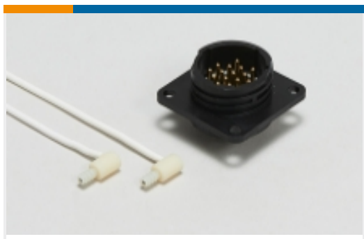
Circular Power Connectors(2)