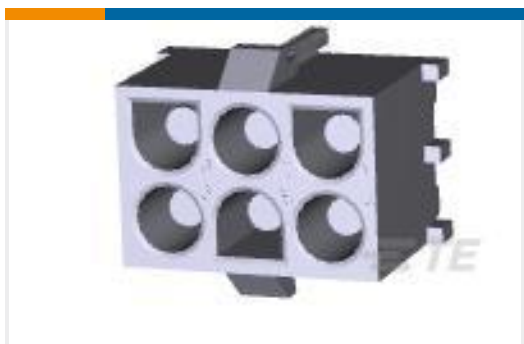
TE Part #643424-1 06P UMNL HDR ASSY POL 94VO