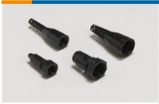
Connector Strain Relief(7)