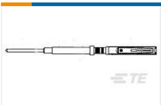
TE Part #211431-6 SKT CONTACT ASSY, SZ 22