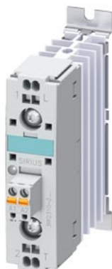
Solid-state contactor 1-phase 3RF2 AC 51 / 10 A / 40 °C 24-230 V / 24 V DC Spring-type terminal