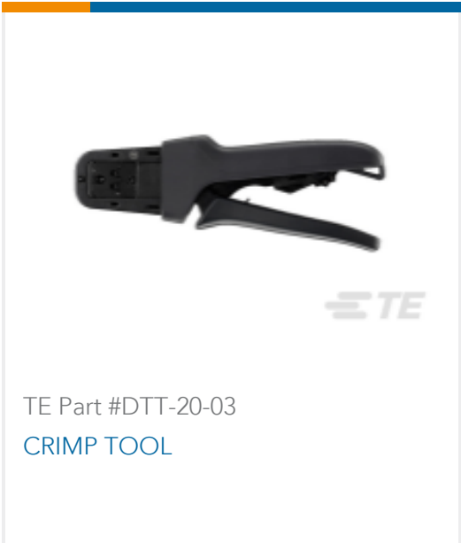
TE Part #DTT-20-03 CRIMP TOOL