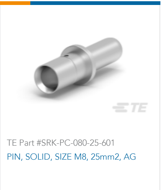
TE Part #SRK-PC-080-25-601 PIN, SOLID, SIZE M8, 25mm2, AG