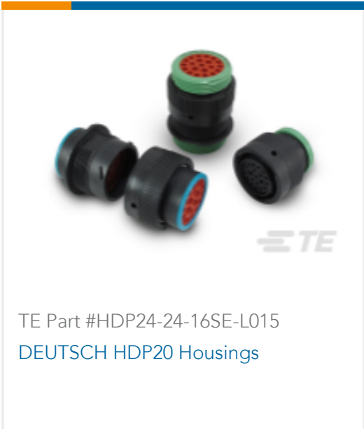
TE Part #HDP24-24-16SE-L015 DEUTSCH HDP20 Housings