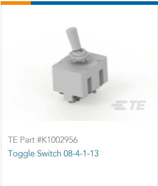
TE Part #K1002956 Toggle Switch 08-4-1-13