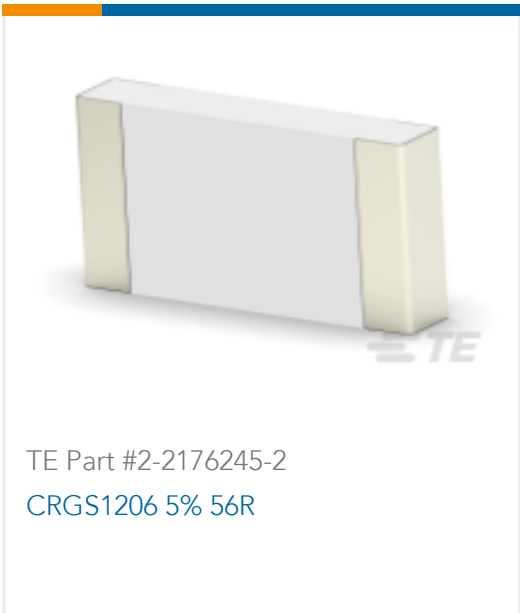
TE Part #2-2176245-2 CRGS1206 5% 56R