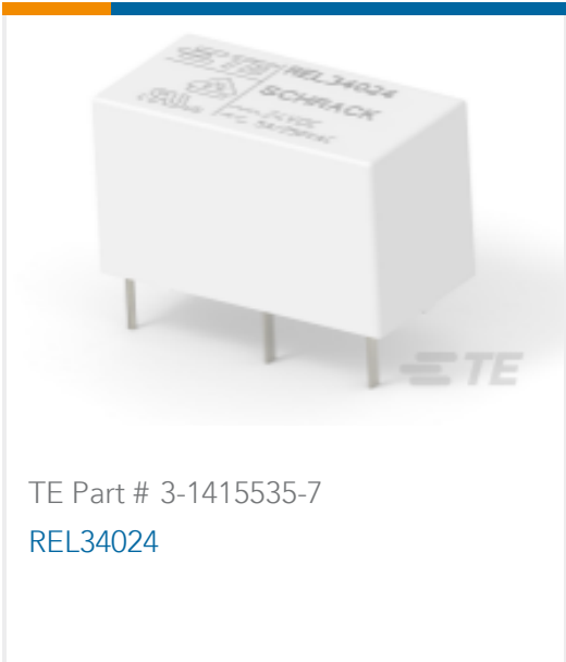
TE Part # 3-1415535-7 REL34024