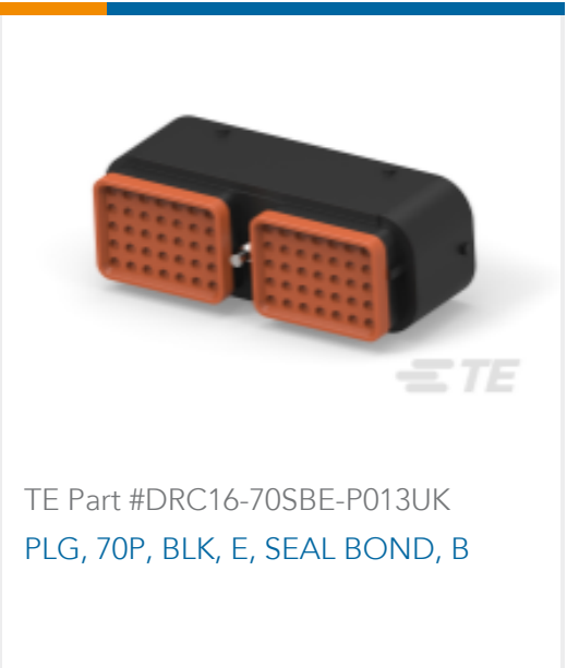
TE Part #DRC16-70SBE-P013UK PLG, 70P, BLK, E, SEAL BOND, B