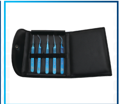
Also available in a 5 piece kit (Item # 18800BTK)