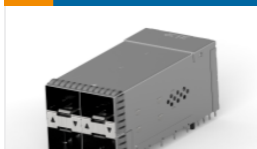
TE Part #2-2343522-0 SFP56 STACKED 2X2 RECEPTACLE ASSEMBLY