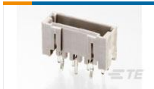
TE Part #292207-4 MINI CT SGL DIP V 4P NAT