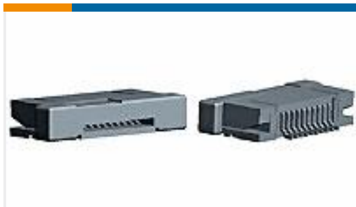
TE Part #1-1734592-0 FPC CONN. 0.5MM PITCH B/C, 10P