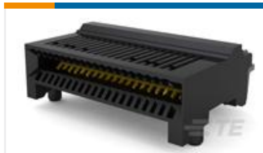
TE Part #1551920-2 zQSFP+ connector assembly