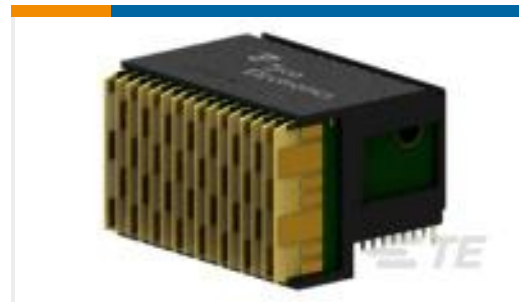
TE Part #1410187-3 MULTIGIG RT T2 7RW DC DF CT