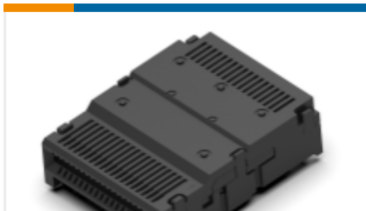
TE Part #2318579-1 RCPT CONN R/A SMT 76 POSN QSFP-DD