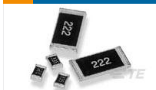
TE Part #1623131-1 CRG0805 1% 1K0