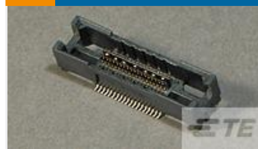
TE Part #2-5767004-2 MICTOR RECEPT ASSY, 38 POS.