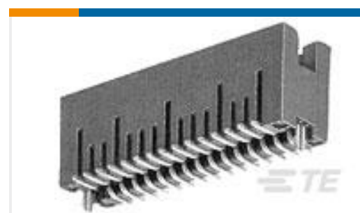
TE Part #5-104656-2 20 50/50 HDR DRST SFMNT.320 SN