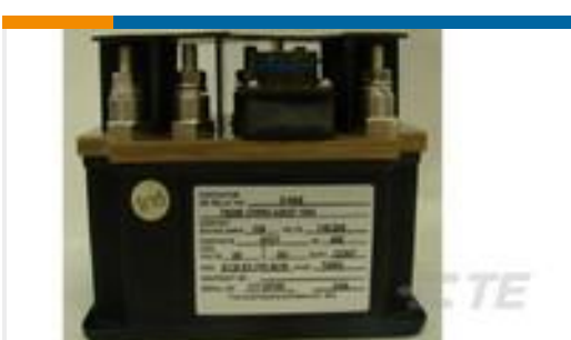
TE Part #1616035-1 D56B=RELAY