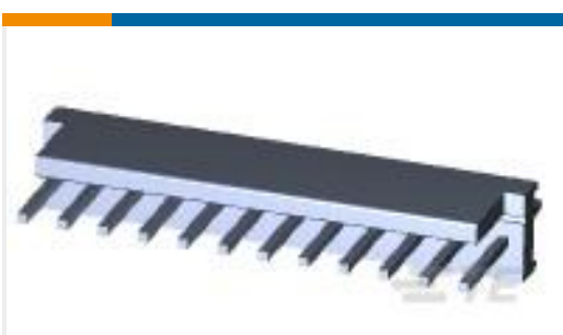
TE Part #1-640454-2 12P MTA100 HDR ASSY SQ STR POL