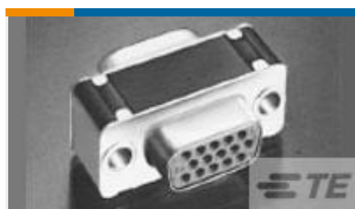
TE Part #212562-2 AMPLIMITE CONN SVR,37 POS,TRW