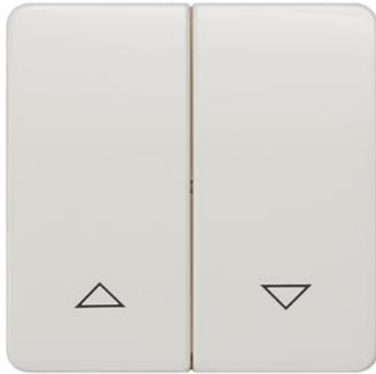
DELTA profil, titanium white Rocker switch with shutter symbols for shutter pushbutton, 65x 65 mm