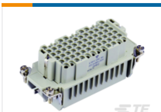
TE Part #T2031442201-000 HDD-072-F 73-144