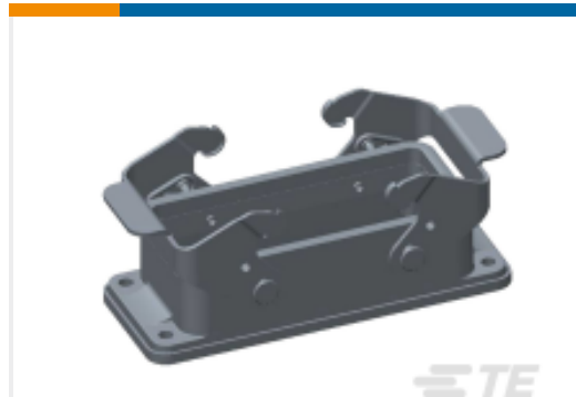
TE Part #T1410162000-000 H16B-AG