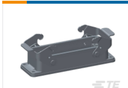
TE Part #T1410242000-000 H24B-AG