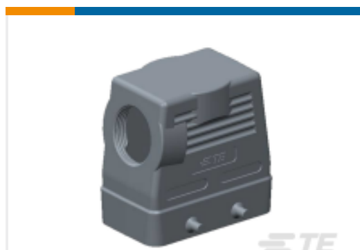
TE Part #T1230160140-000 H16B-TSH-M40