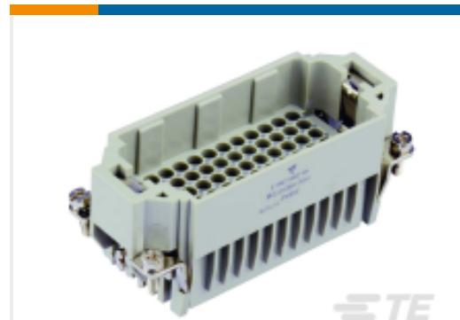
TE Part #T2031442101-000 HDD-072-M 73-144