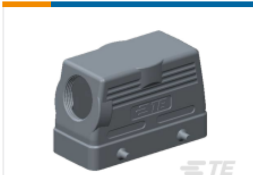
TE Part #T1210160121-000 H16B-TS-PG21