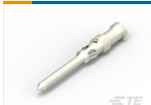
TE Part #T2020001010-000 CDM-1.0