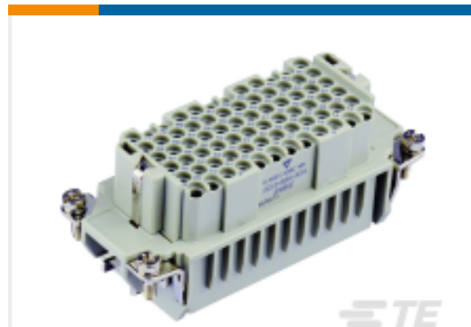
TE Part #T2030722201-000 HDD-072-F