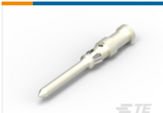
TE Part #T2020001005-000 CDM-0.5