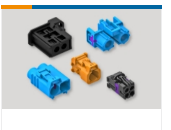
Data Connectivity Housings(3)