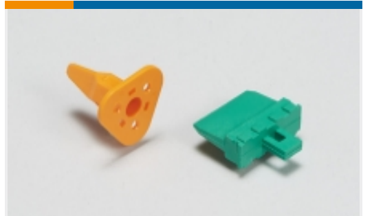
Automotive Connector Locks & Position Assurance(2)