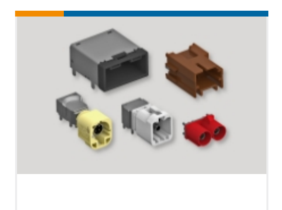
Data Connectivity Headers(2)