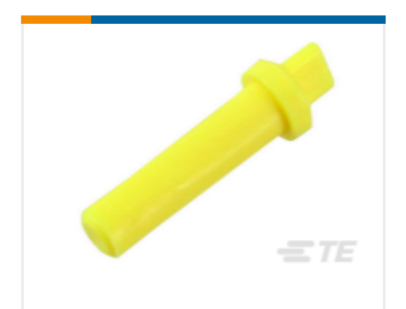
TE Part # 776363-1 SEALING PLUG, SZ 16 CAVITY