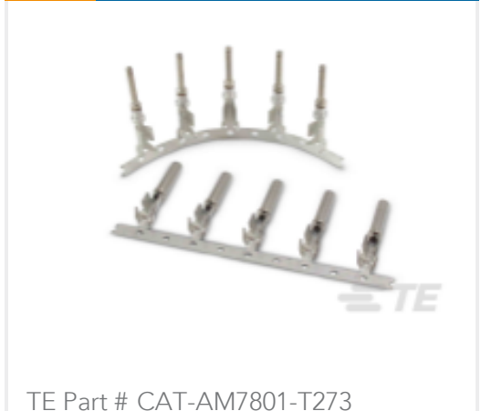
TE Part # CAT-AM7801-T273 AMPSEAL 16 CONTACTS