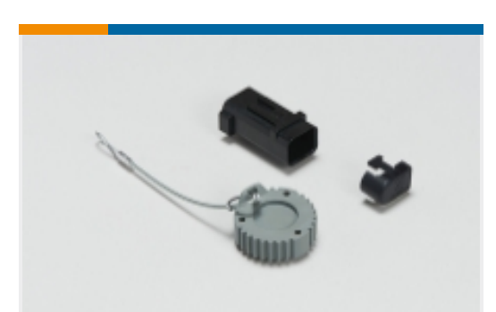
Automotive Connector Caps & Covers (3)