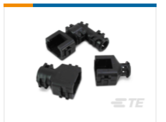
TE Part # CAT-AM7801-B128 AMPSEAL 16 Connectors Backshell