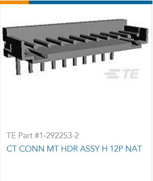
TE Part #1-292253-2 CT CONN MT HDR ASSY H 12P NAT