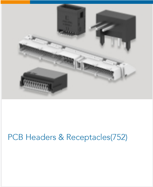
PCB Headers & Receptacles(752)