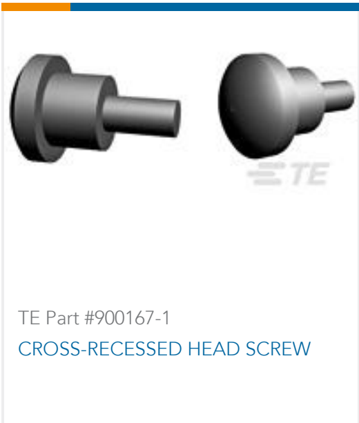
TE Part #900167-1 CROSS-RECESSED HEAD SCREW