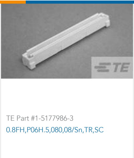
TE Part #1-5177986-3 0.8FH,P06H.5,080,08/Sn,TR,SC