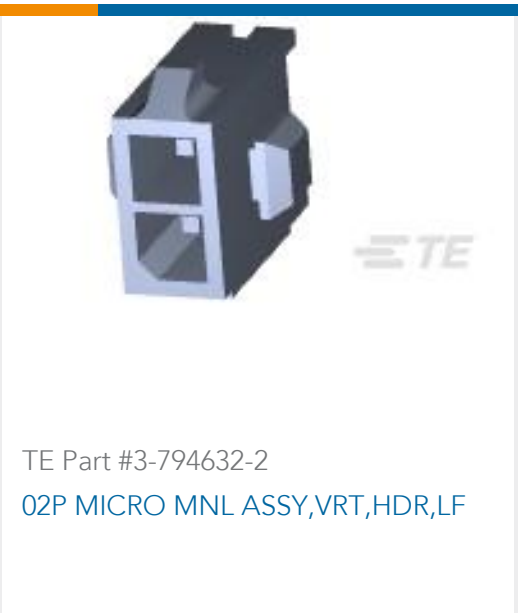
TE Part #3-794632-2 02P MICRO MNL ASSY,VRT,HDR,LF

Product Drawings 0.8 FH PLUG ASSY 80P R/ANGLE