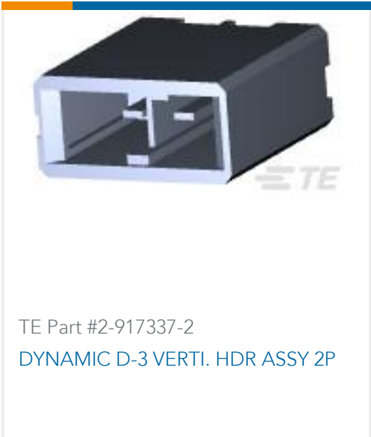
TE Part #2-917337-2 DYNAMIC D-3 VERTI. HDR ASSY 2P