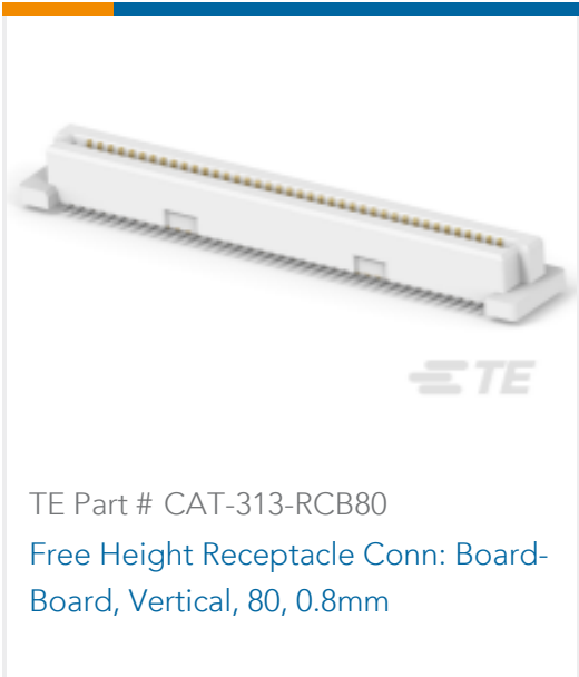
TE Part # CAT-313-RCB80 Free Height Receptacle Conn: Board-Board, Vertical, 80, 0.8mm