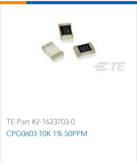
TE Part #2-1623703-0 CPG0603 10K 1% 50PPM