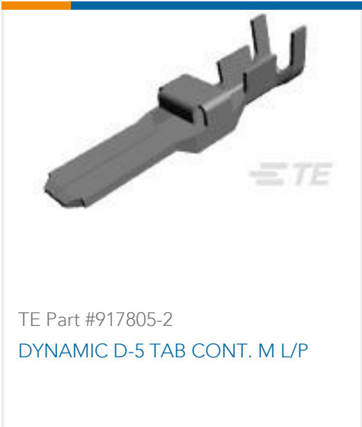
TE Part #917805-2 DYNAMIC D-5 TAB CONT. M L/P