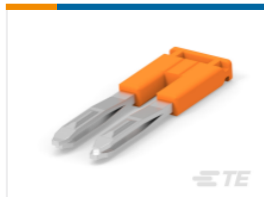
TE Part #1SNK905302R0000 JB5-2