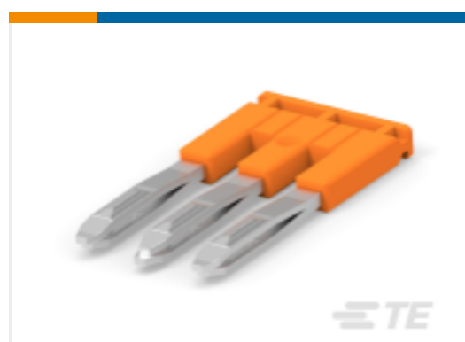
TE Part #1SNK905303R0000 JB5-3