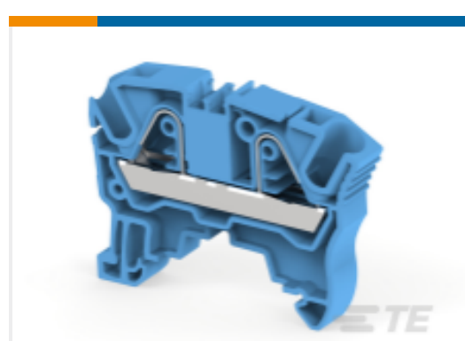
TE Part #1SNK708020R0000 ZK6-BL