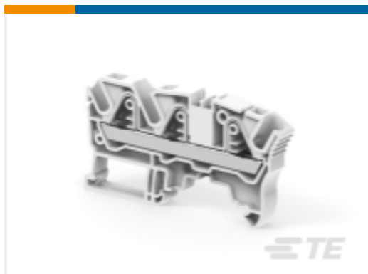
TE Part #1SNK708011R0000 ZK6-3P