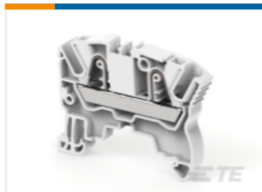
TE Part #1SNK706010R0000 ZK4