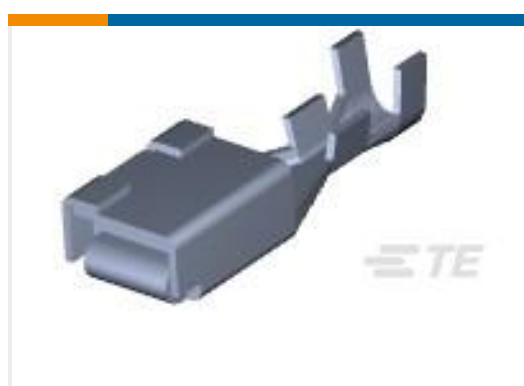
TE Part #1318986-2 DYNAMIC D-5 REC CONT SS L/P AU