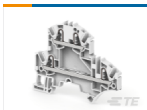
TE Part #1SNK705210R0000 ZK2.5-D2