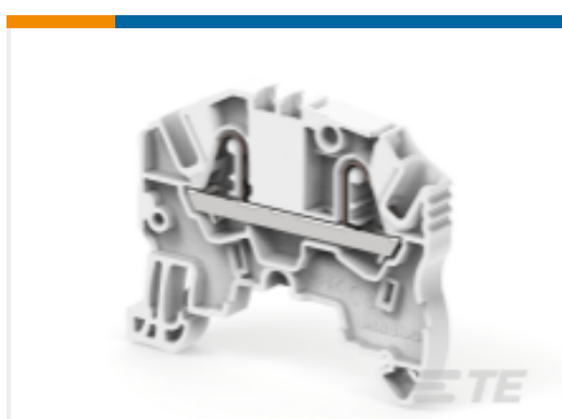
TE Part #1SNK705010R0000 ZK2.5