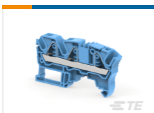
TE Part #1SNK708021R0000 ZK6-3P-BL