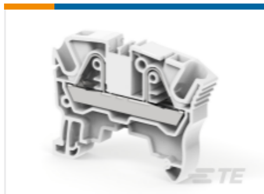
TE Part #1SNK708010R0000 ZK6